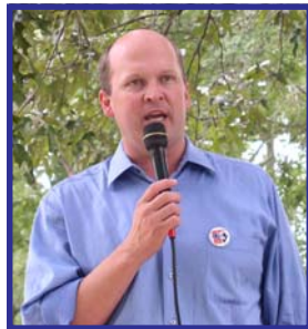
Senate Hopeful Mikal Watts