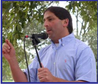
Senator Kevin Eltife

The Smith County Central Labor Council had its annual picnic on Monday, Labor Day, at the United Steelworkers Local 746L grounds. The event was open to the public, and began about 10 a.m. The organization does not limit attendance to members of its affiliated labor unions; but rather considers the event a means of providing food and a good time for all area employees, especially those who might earn less than workers in unionized plants.