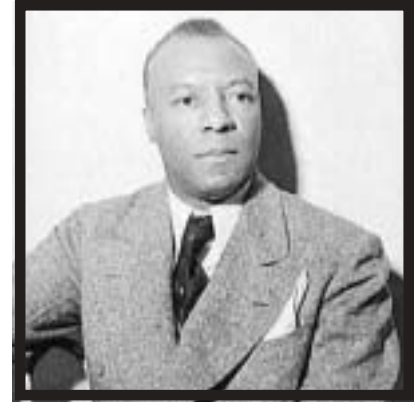
Asa Philip Randolph

Mr. Randolph died on May 16, 1979, a few weeks after his 90th birthday. His legacy is celebrated through the work of the A. Philip Randolph Institute.